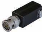
DS-1H18 Video Balun