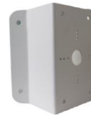
DS-1276ZJ Corner Mount