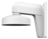
DS-1272ZJ-110-TRS Wall Mount