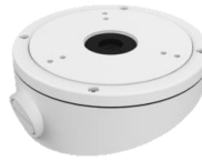
DS-1281ZJ-S Inclined Base Mount