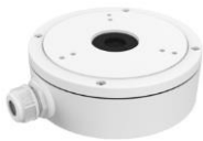
DS-1280ZJ-S Junction Box