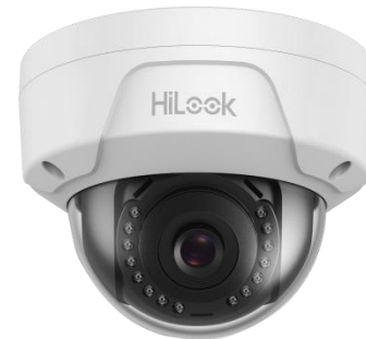
2.8 mm Fixed Focal Lens