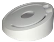
DS-1259ZJ Inclined Base Mounting Bracket