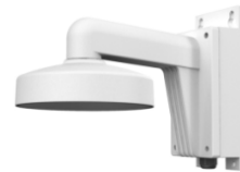
DS-1272ZJ-110 Wall Mounting Bracket