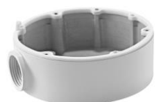
DS-1280ZJ-DM18 Junction Box